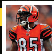
CHAD "OCHOCINCO" JOHNSON

I SEE YOU OUT THERE, EVERY DAY ASK YOURSELF, "HOW CAN I MAKE MY QB & COORDINATORS JOB EASY" BECOME THAT SECURITY BLANKET FOR THEM BOTH & FLOURISH